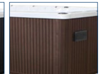
*Espresso (Upcharge may apply)