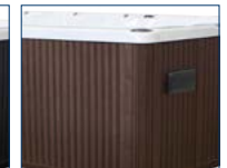
*Espresso (Upcharge may apply)